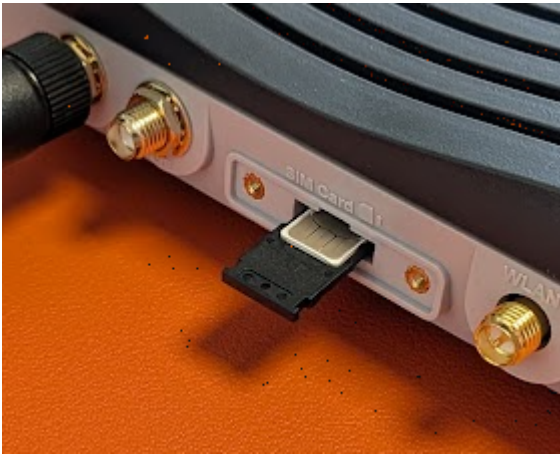
SIM in tray (SIM 1 position)