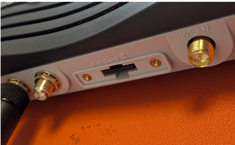
SIM tray properly clicked into place